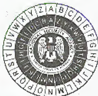
The Cipher Disk